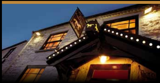
'The Award Winning Copper Horse Restaurant'

York 40 Miles, North York Moors (including Whitby & Pickering ) 20 miles, Filey 9 miles, Scarborough 4 miles.